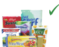
Cardboard boxes & cartons