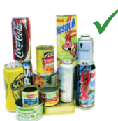
Steel & aluminium cans & empty aerosols