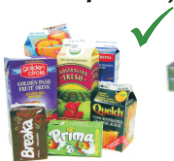
Milk & juice cartons