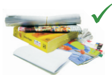
Newspaper, paper, magazines & brochures