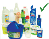
Rigid plastic containers & bottles from the kitchen, bathroom & laundry