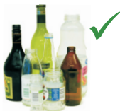
Glass bottles & jars (No lids please)